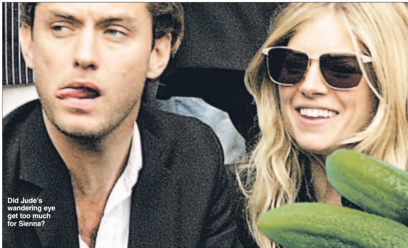
Did Jude's wandering eye get too much for Sienna?